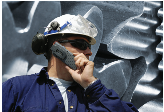
Action Tech's expertise is strong in the industrial and construction sectors.

Action Tech works to help its clients be agile in hiring. It is not unusual now for workers to start on Action Tech's payroll, working under the supervision of the client. Months later, these workers may transition to become a full-time employee as the client's business needs evolve. This is easy and affordable with Action Tech.